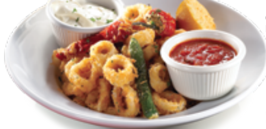
CALAMARI DELLA CASA

Over 20 items to choose from: appetizers, soups, salads, pastas, pizzas and dessert!