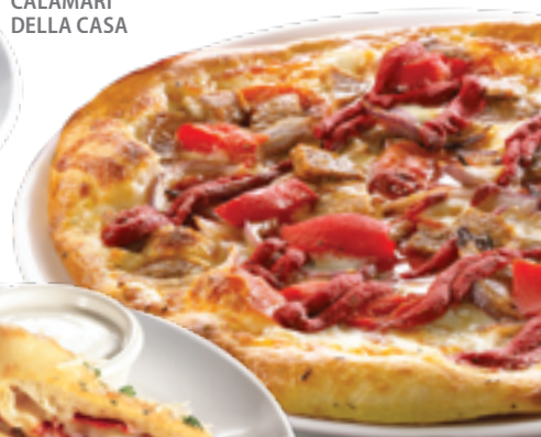
AMORÉ WOODSTONE PIZZA