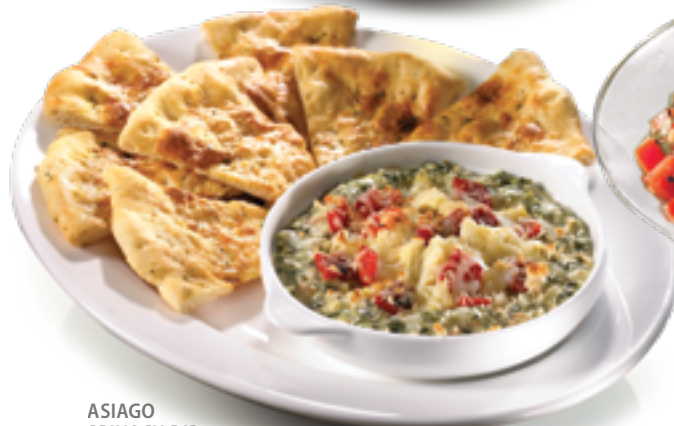
ASIAGO SPINACH DIP