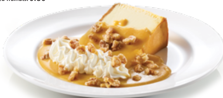
SALTED CARAMEL CHEESECAKE