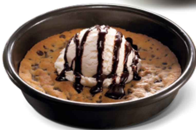
DEEP DISH COOKIE