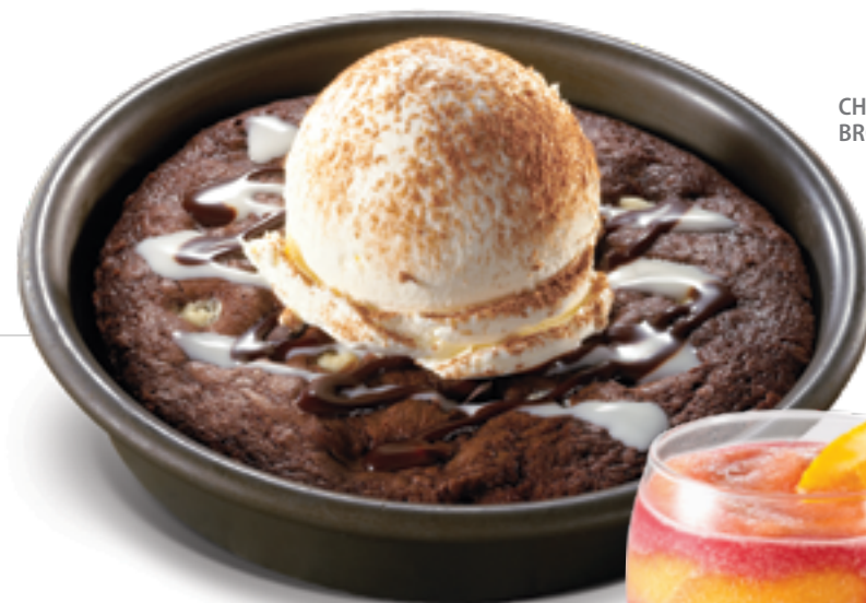
CHOCOLATE BROWNIE BLISS

Our decadent cheesecake topped with a delicious salted caramel sauce and garnished with whipped cream and sugared walnuts. 9.50