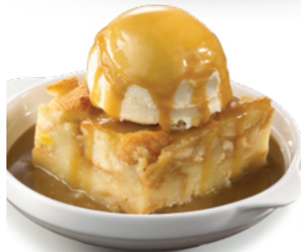
DULCE DE LECHE BREAD PUDDING