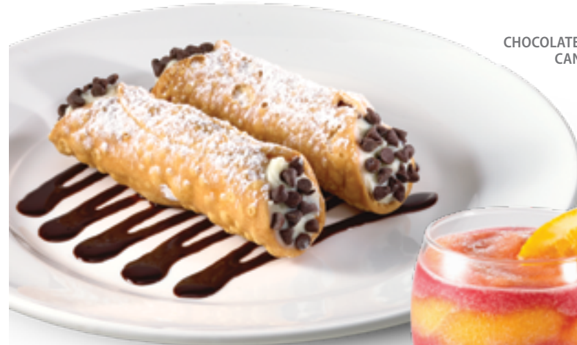
CHOCOLATE CHIP CANNOLI