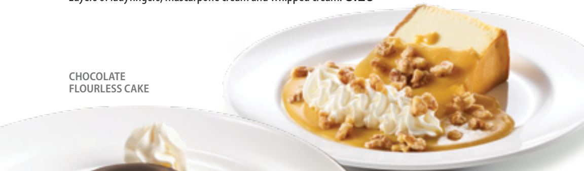
SALTED CARAMEL CHEESECAKE