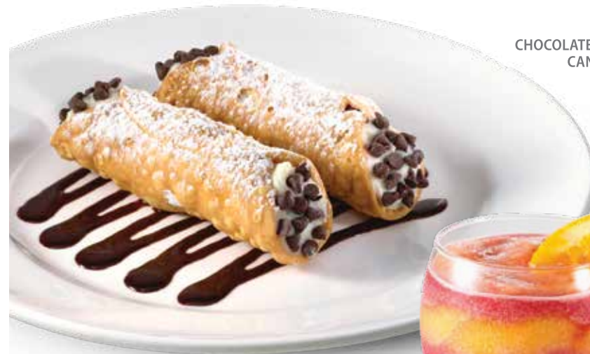
CHOCOLATE CHIP CANNOLI

Layers of ladyfingers, mascarpone cream and whipped cream. 8.25