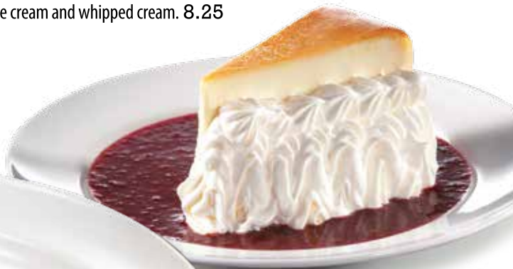
CHEESECAKE WITH STRAWBERRY- AMARETTO COULIS