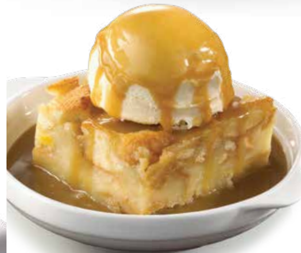
DULCE DE LECHE BREAD PUDDING