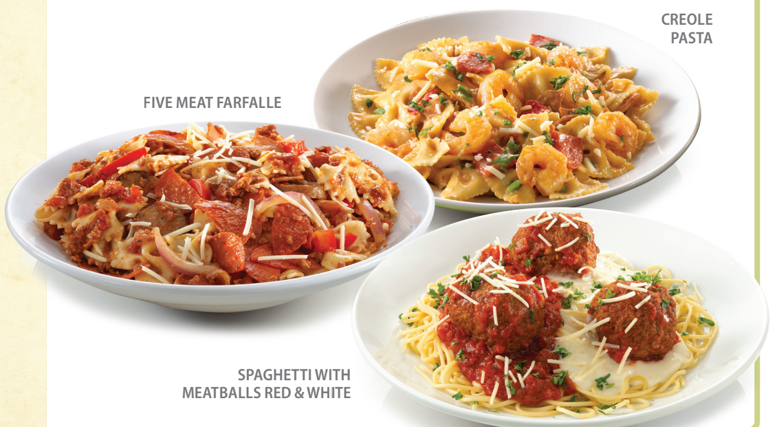
FIVE MEAT FARFALLE

Our popular Spaghetti with Meatballs served with both marinara sauce and Alfredo sauce side by side. 12.75