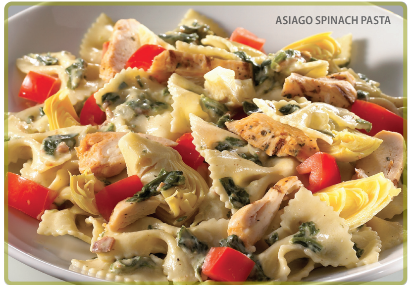
ASIAGO SPINACH PASTA