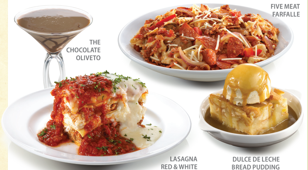
THE CHOCOLATE OLIVETO

Dulce de Leche Bread Pudding Moist, house-made bread pudding served warm with a scoop of premium vanilla ice cream and rich dulce de leche sauce. 8.00