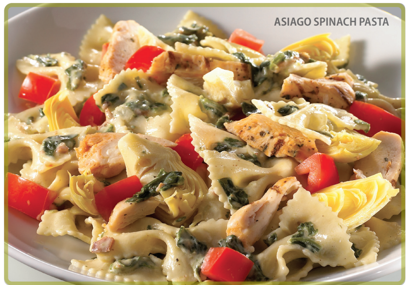
ASIAGO SPINACH PASTA

Italian Nachos Crispy wonton chips topped with Alfredo sauce, crispy pepperoni, Italian sausage, roasted red peppers, Kalamata olives, cheddar, mozzarella and provolone cheeses. Garnished with jalapeño peppers, green onions and drizzled with our balsamic reduction. 10.75