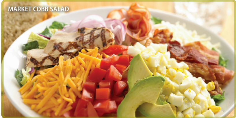
MARKET COBB SALAD