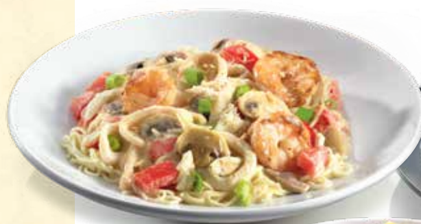
SEAFOOD PASTA TRIO

Seafood Pasta Trio Shrimp, calamari, and crab sautéed in lemon garlic butter with mushrooms, tomatoes, white wine and green onions. Tossed with Alfredo sauce and angel hair pasta and garnished with Asiago cheese. 16.00