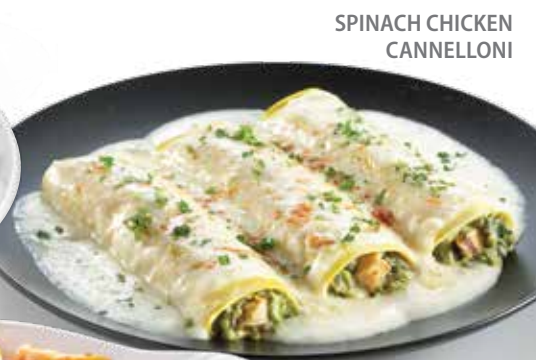
SPINACH CHICKEN CANNELLONI