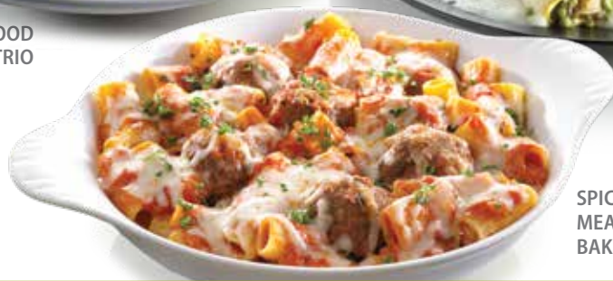
SPICY MEATBALL BAKE