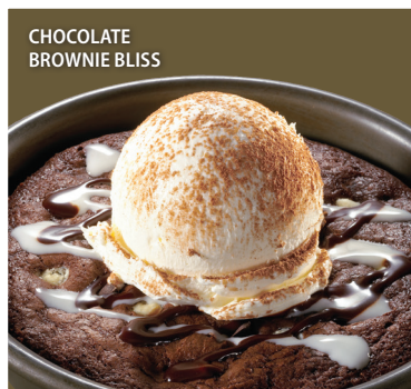
CHOCOLATE BROWNIE BLISS