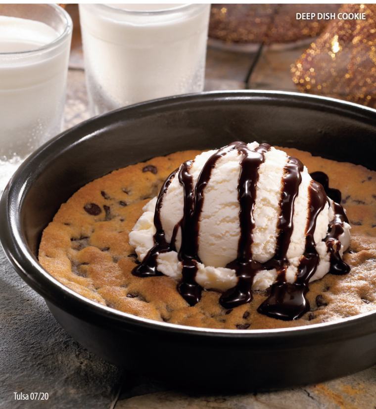
DEEP DISH COOKIE