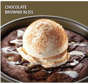
CHOCOLATE BROWNIE BLISS