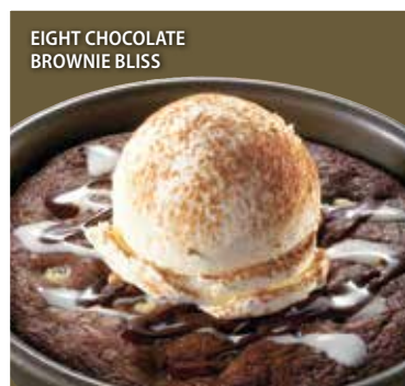
EIGHT CHOCOLATE BROWNIE BLISS