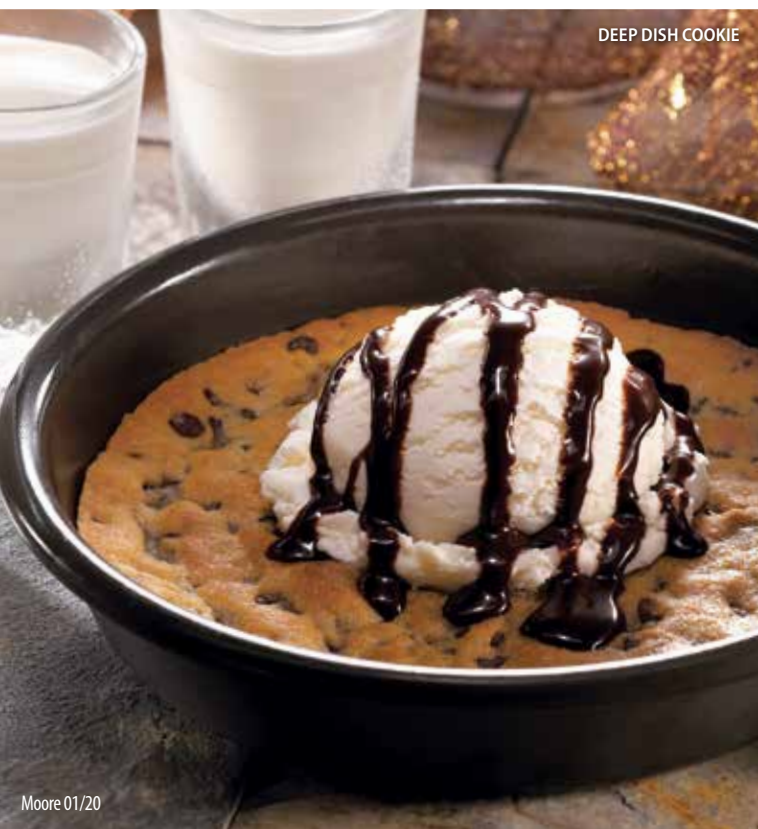
DEEP DISH COOKIE