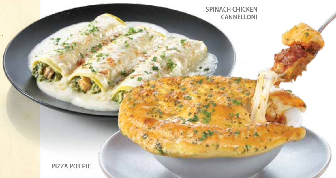
SPINACH CHICKEN CANNELLONI

Pizza Pot Pie A Chicago-inspired classic! Provolone and mozzarella cheese, meat sauce and meatballs, topped with our house-made pizza dough and baked until golden brown. 12.00